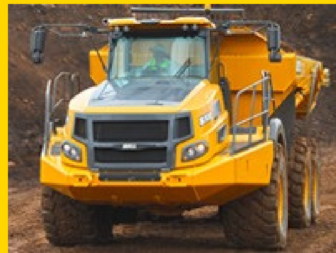
B50E & B60E (4x4)